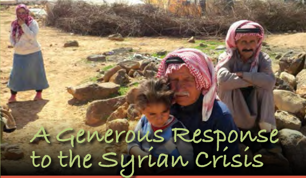
Refugee camp in Jordan near the Syrian border